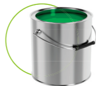
Paints and compounds