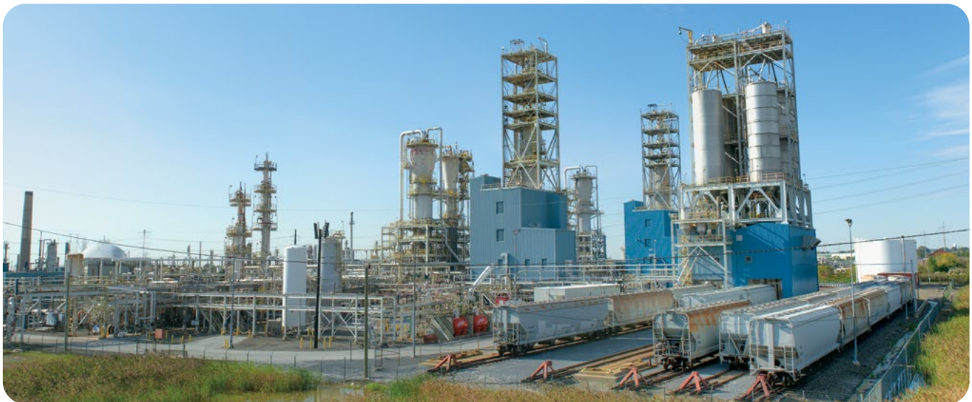
Marcus Hook, Pennsylvania