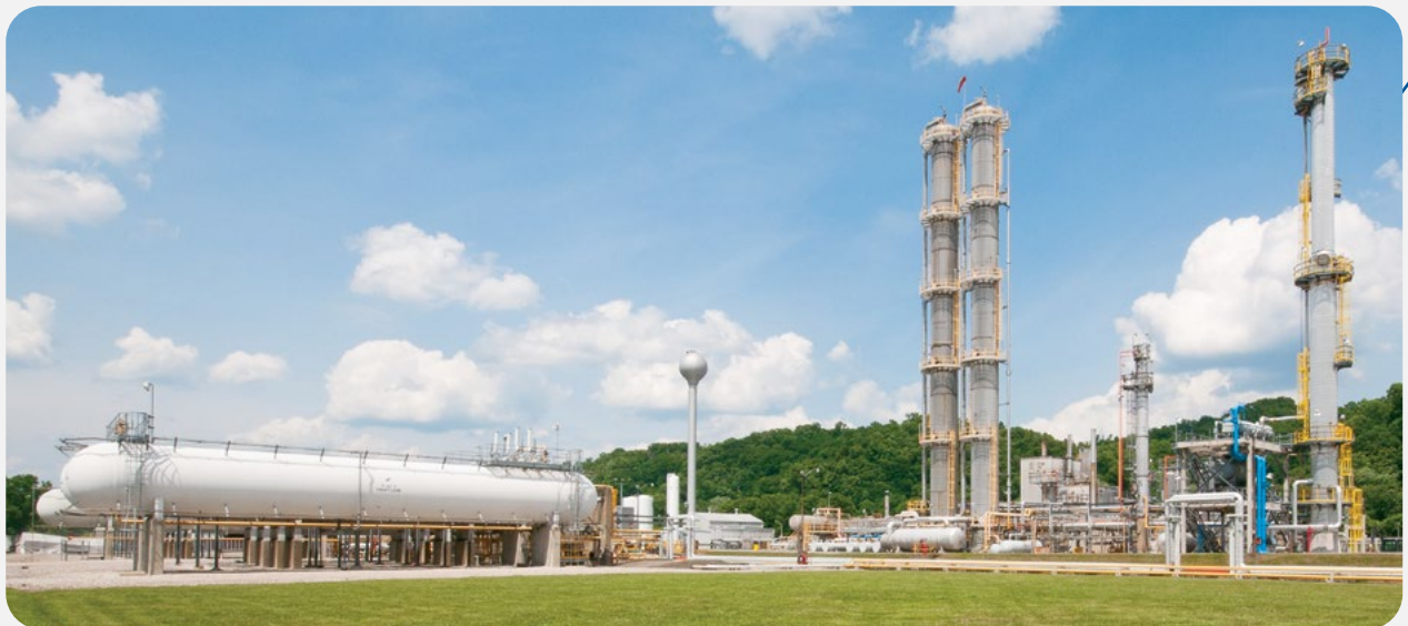
Neal, West Virginia

We focus on being responsive to our North American clients' needs with service levels and supply security unmatched by the competition. At the heart of this is geographic diversity that provides reliable sourcing, with production facilities in Pennsylvania, West Virginia, and Texas.