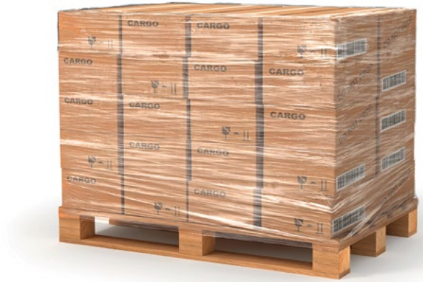
Stretch Wrap DR 376_01