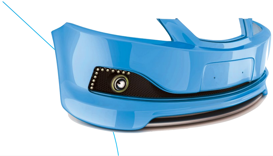
Compounding - Typical Properties