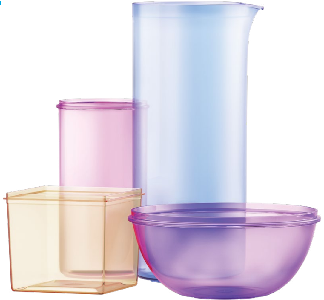
Injection Molding - Typical Properties