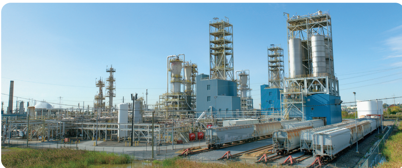
Marcus Hook, Pennsylvania