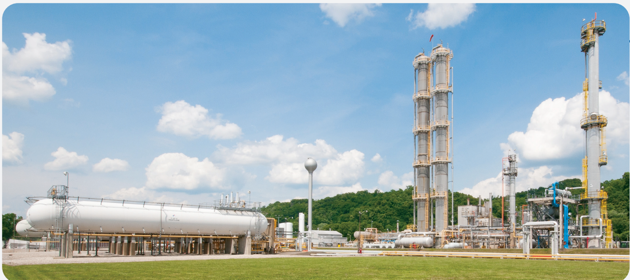
Neal, West Virginia

We focus on being responsive to our North American clients' needs with service levels and supply security unmatched by the competition. At the heart of this is geographic diversity that provides reliable sourcing, with production facilities in Pennsylvania, West Virginia, and Texas.